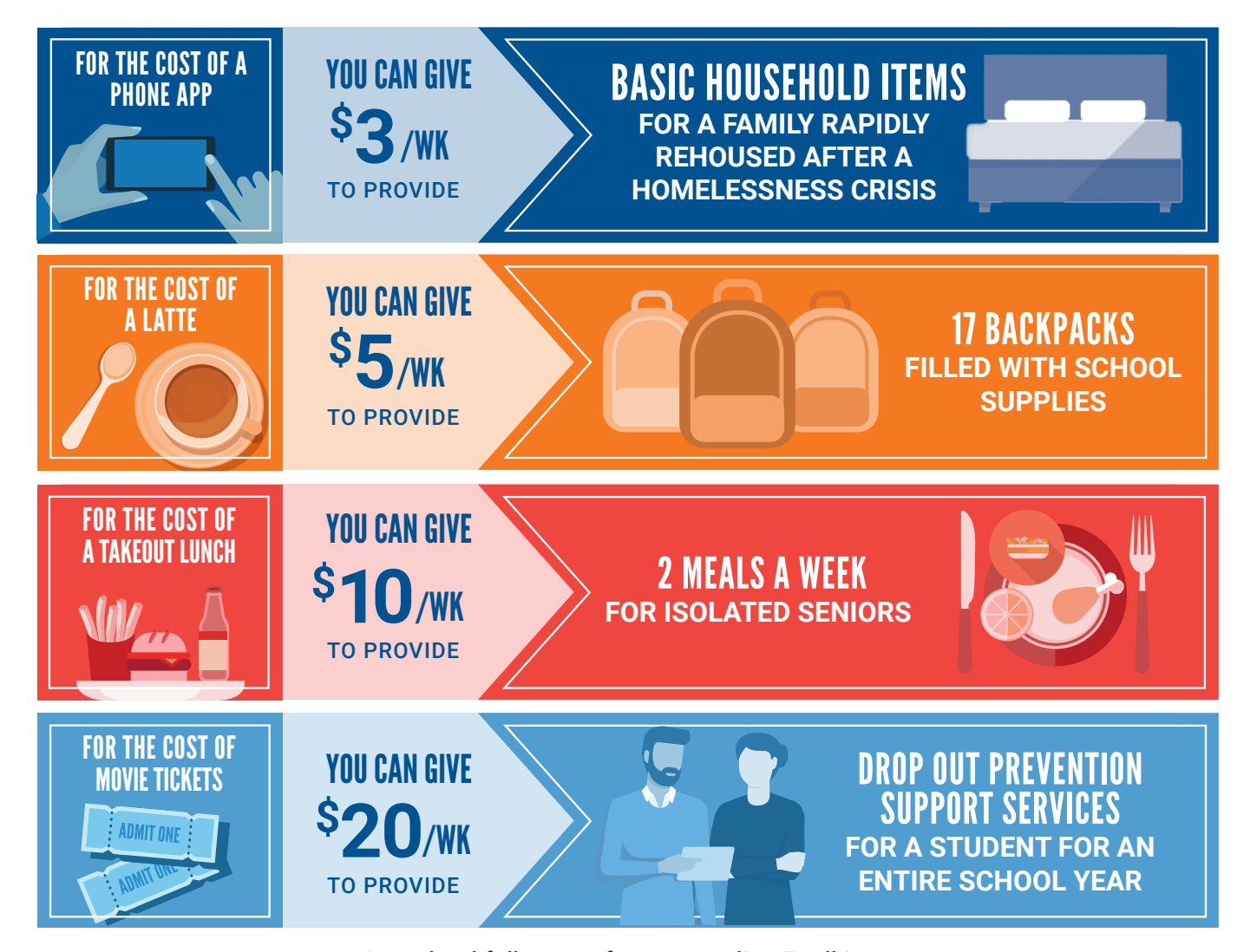
Download full poster from our online Toolkit.